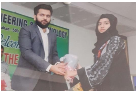
The Vice Chairman Sir