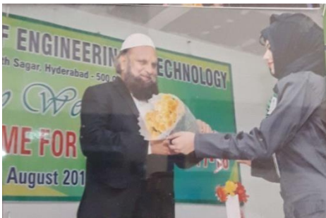
The Honorable Chairman Sir

The Orientation Programme was organized on 2 nd August 2017, for B.Tech 2017-18 batch , Senior students have accorded a warm welcome to their juniors. Celebration was done warmly and guests were added to the family of LIET with lot of enthusiasm, expectations, assurances and bright hopes.