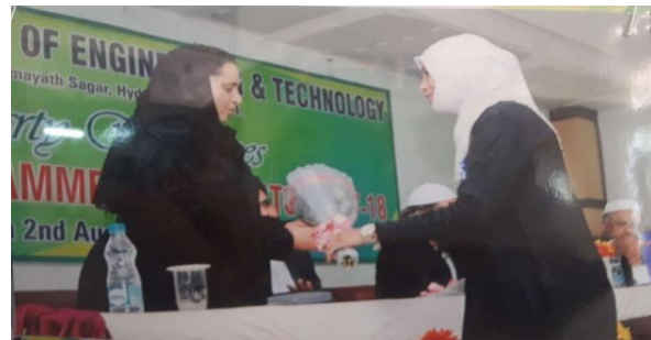
The Secretary Madam