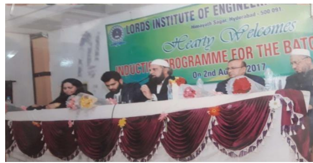
The Principal and Director Sir

The Management of LIET welcomes the freshers and their parents to LIET the audience were addressed by the Chairman sir, the Secretary madam, Vice Chairman Sir, Principal, Director R&D, HODs & some senior students shared their experiences.