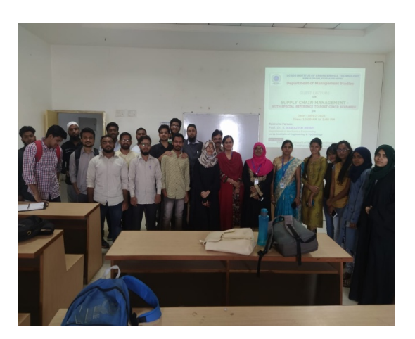
Group Photo with Guest, Principal, Staff and Students