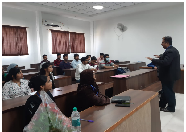
During the Lecture