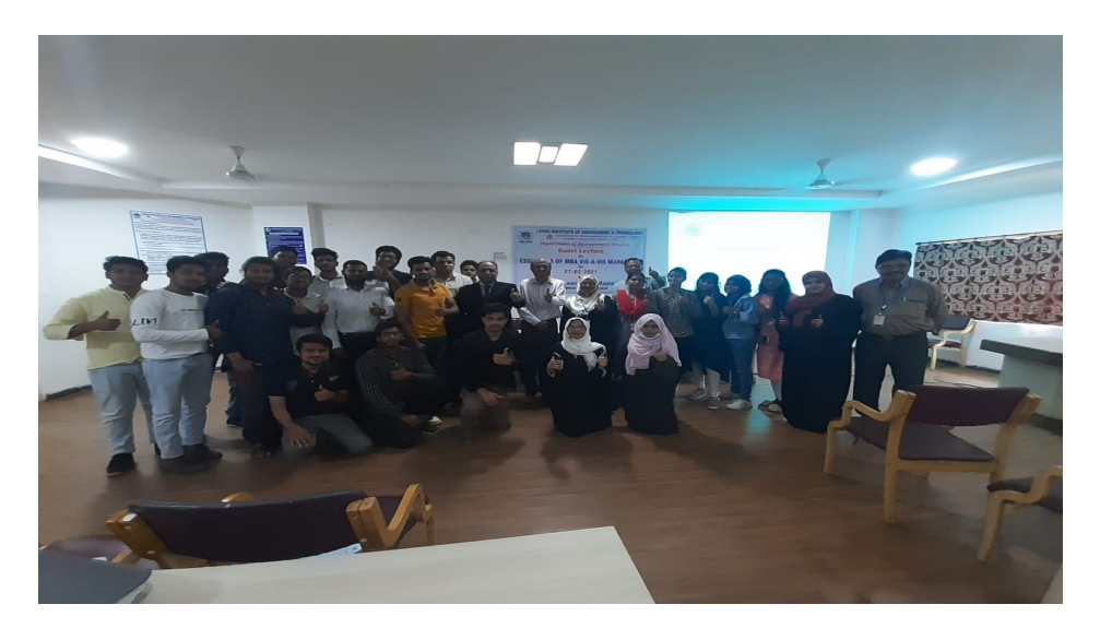
A group Photo with the students and faculty member