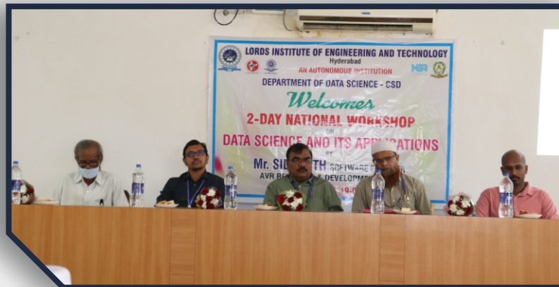
Photo of Inaugural Ceremony