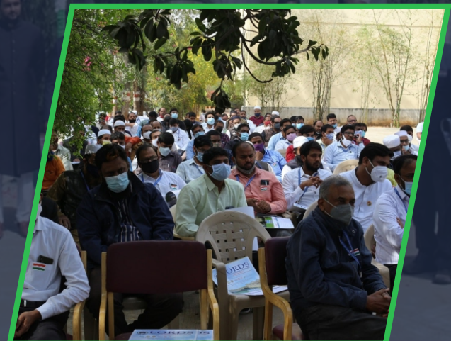
Staff and Students