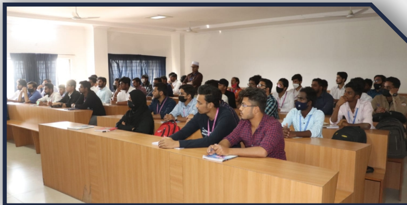
CSD 2nd year students