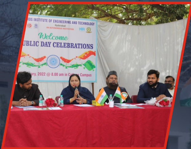
Dignitaries of LIET

Freedom in mind, faith in our heart and memories in our souls. Let us salute our nation on Republic Day