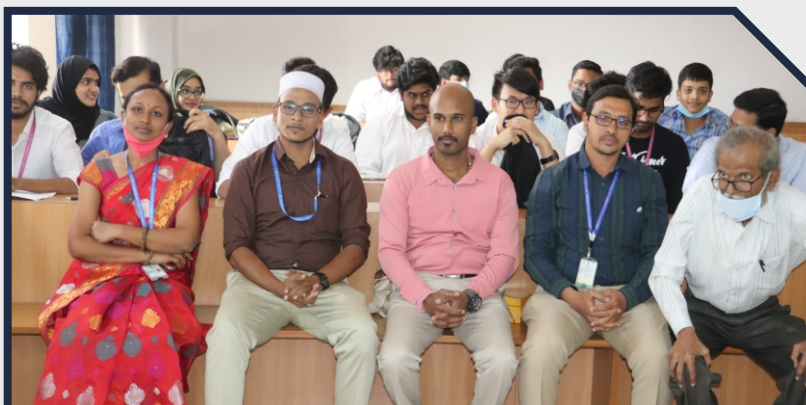
Photo of Faculty Members on final day of the workshop.