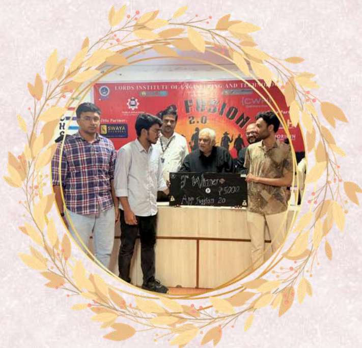
Third Prize – Cash Prize: ₹5,000, Team PORTS, VJIT

The winners of AppFusion 2.0 stood out with their creativity, technical skills, and problem-solving approach.