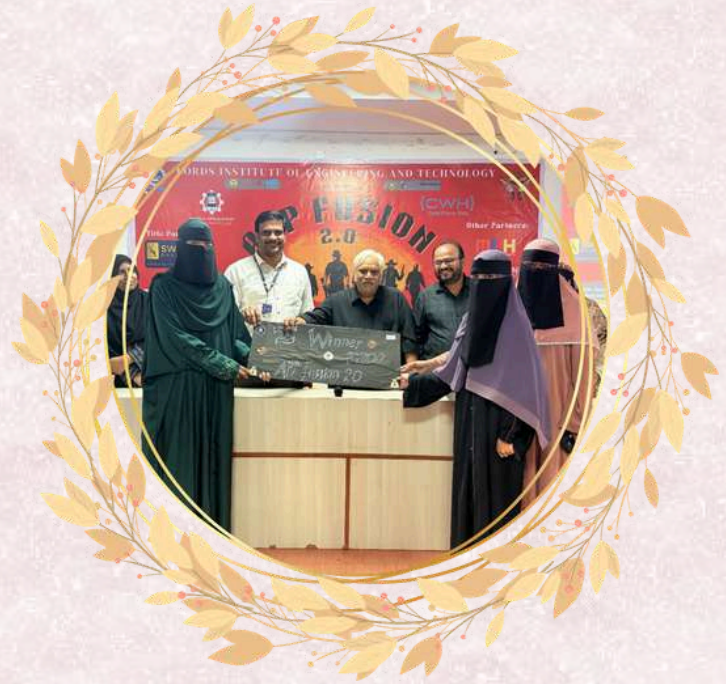
Second Prize– Cash Prize: ₹7,000, Team SheCodes, LIET