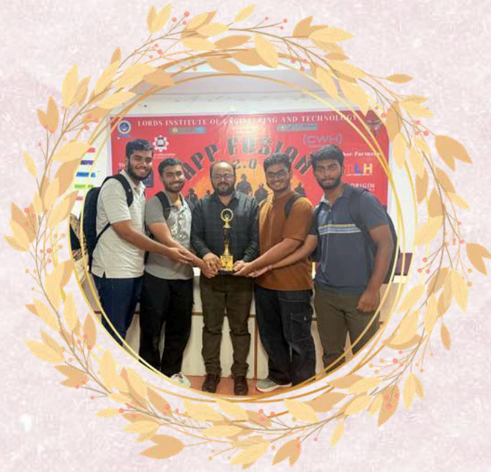
First Prize– Cash Prize: ₹10,000, Team Cache-e-Kebab, LIET